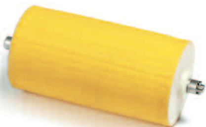
Inflated pressure balloon for NOCK conveyORIZED derinding machines (optional)