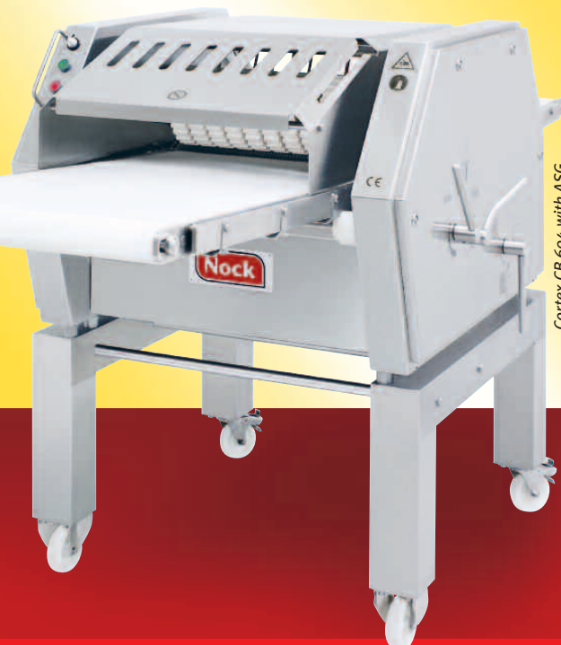
Cortex CB 504 • CB 604 • CB 704