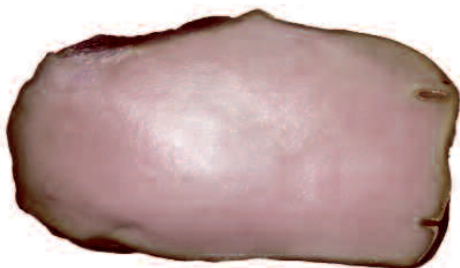
Smoked ham, derinded