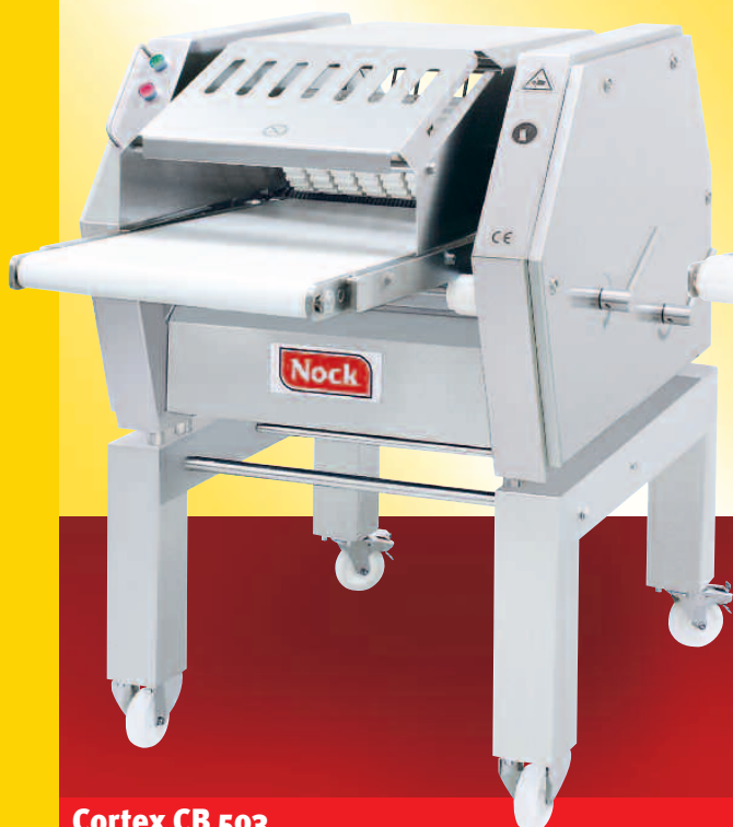
Cortex CB 503

The conveyORIZED NOCK derinding machines for industrial use are equipped with long conveyors and operate with high cutting speeds. They may not be operated in open top (manual) operation.