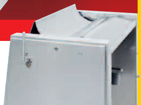
Cortex C 860 with changeable table for loins

Cortex C 860 with changeable table for ham with bones